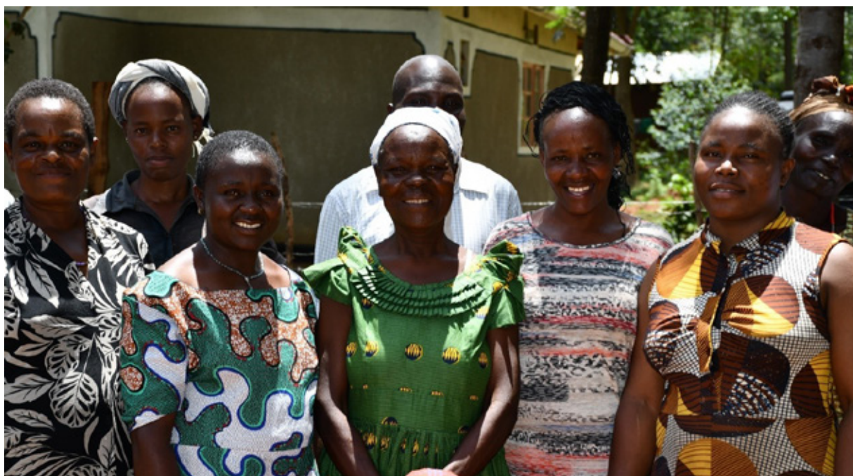
Members of the St Magdalene Women Group.

In 2006, the first members of Bungoma's St Magdalene Women Group came together to help each other and eradicate poverty. The group seeks to display the care and humility of the biblical figure of Mary Magdalene. The members aim to promote food security by increasing the production of maize, African Leafy Vegetables, and potatoes, while improving livelihoods in their community. To ensure financial inclusion, the group engages in "table banking", an internal savings and lending scheme. To enable good governance, the members meet every week.