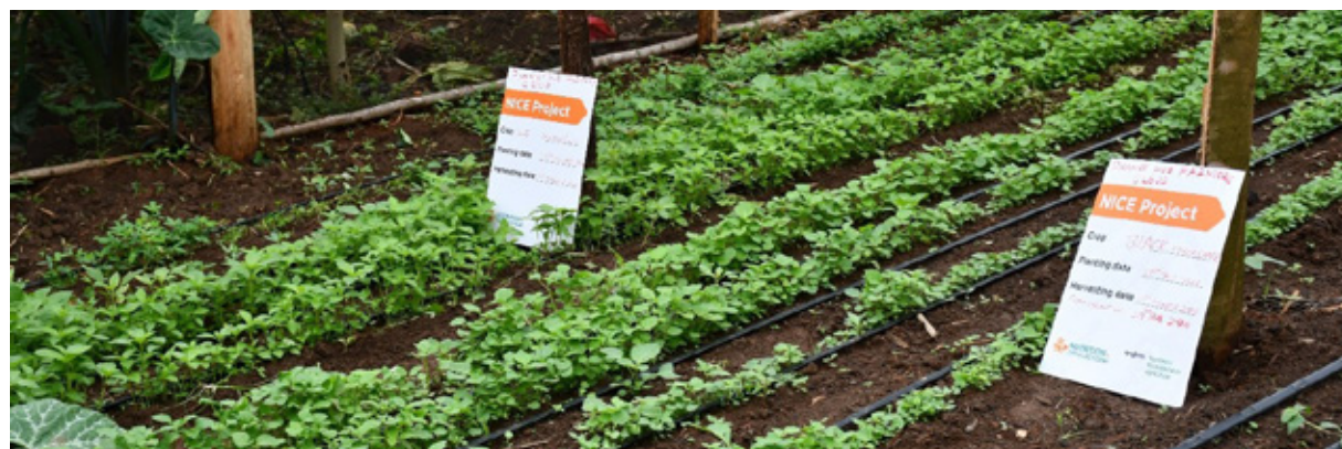
Black Nightshade and Spider Plant growing in a shed net at Phanice Farmers' Hub.

The group has already made great sales from African Leafy Vegetables (ALV). So far, local schools and other Bungoma customers have bought about 300 kg. With lots of farmers growing ALV in a small geographical area, there is a risk of a glut at harvest time and therefore lower prices. But Phanice's clients have learned how to benefit. They now sell any surplus during the dry season when prices are higher.