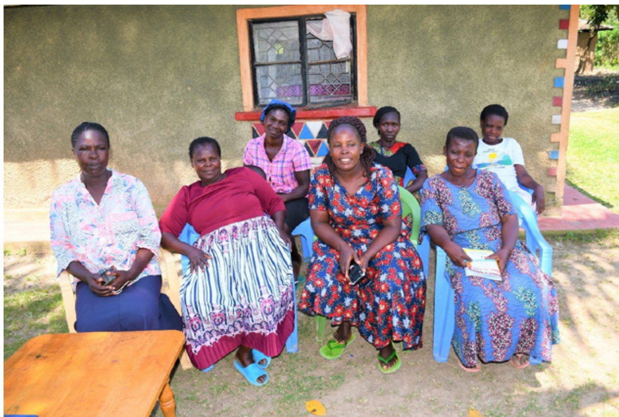
Mumbiri Self-Help group members

Self-Help Group has good reasons for pride