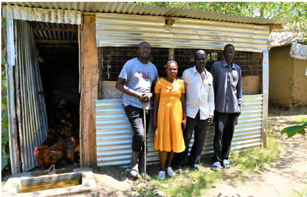
Members of the Mwenge Self-Help Group